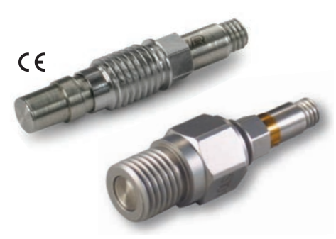
Model 113B / 102B High Frequency Pressure Sensors